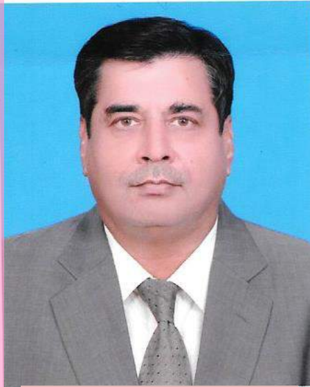
Amb. TCA Raghavan

INDIAN COUNCIL OF WORLD AFFAIRS | SAPRU HOUSE, BARAKHAMBA ROAD, NEW DELHI