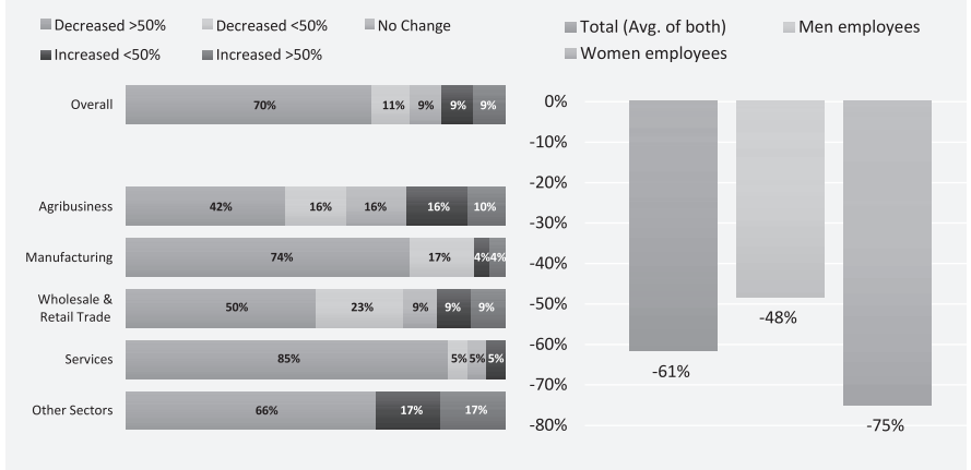
Figure 2. Consumer demand by sector of activity (% of respondents). Figure 3. Average % drop in employment. ■ Decreased >50% Decreased <50% ■ No Change ■ Total (Avg. of both) ■ Women employees ■Increased <50% ■ Increased >50% 0% Overall 70% 11% 9%

Source: Afghanistan Development Update, October 2022 (World Bank).<sup>67</sup>