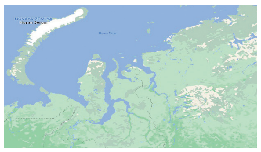
Map Three: Novaya Zemlya

a growing Russian presence in the North.<sup>48</sup> Various components of the Russian and American missile warning systems are located in the Arctic Zone. The American air-defence interceptors are located in Alaska, and Russian analogues are located on the coast of the Arctic Ocean<sup>49</sup>. Russia also has a nuclear testing area on Novaya Zemlya (an archipelago in the North of Russia in the Arctic Ocean).